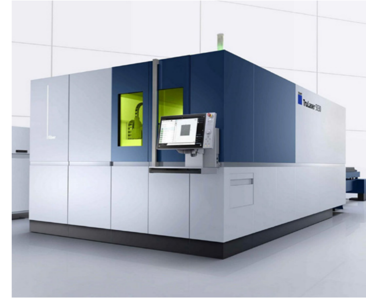
TRUMPF - Trulaser 5030