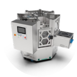
Food & Pharma Machinery